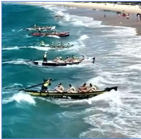
Open Female Surf Boat Final – places 2 to 6 -this is how close the Crusaders came to a silver medal