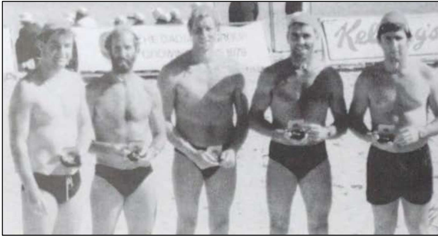
1984 and 1985 Reserve Boat Champions