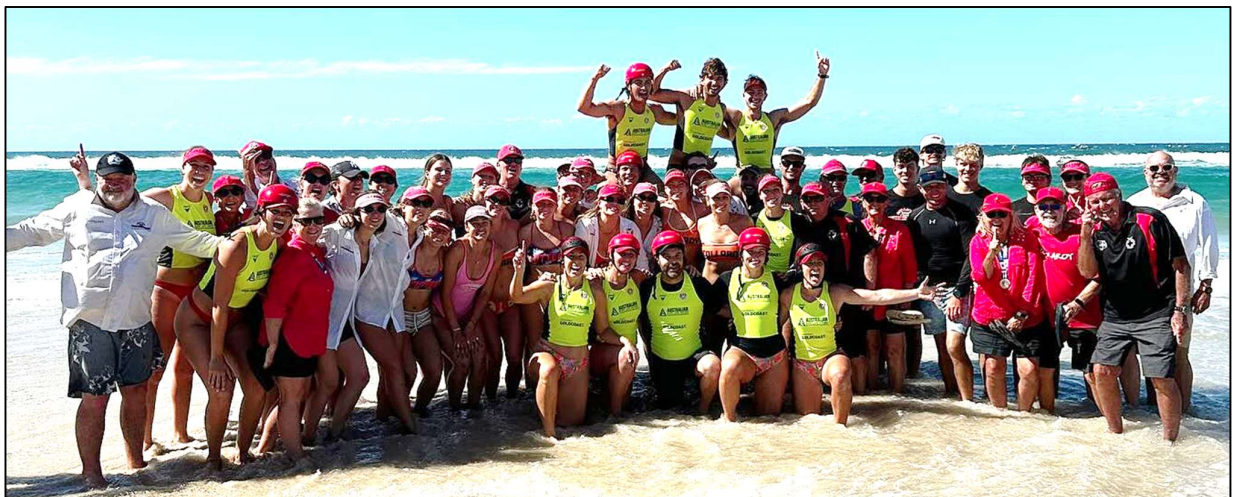
Collaroy members celebrating after the win