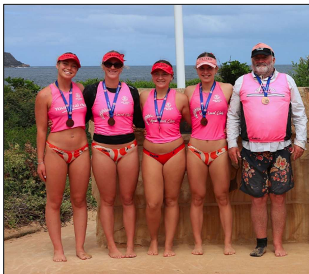
Collaroy Cannons – 3 rd in the U23 Female Surfboat