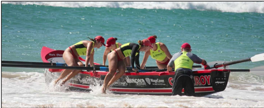
Crusaders – 5 th place Open Female Surfboat Final