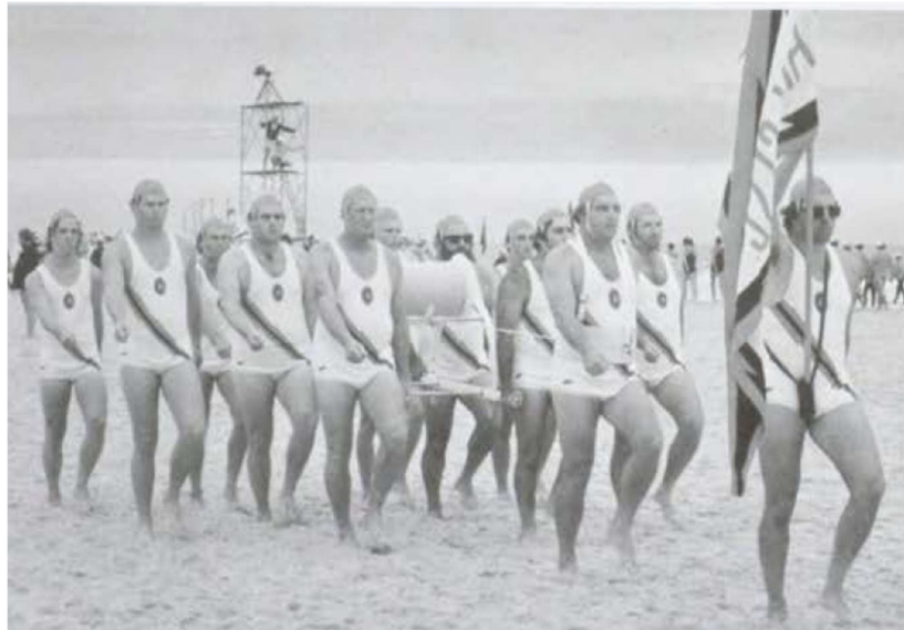
1979 March Past Champions