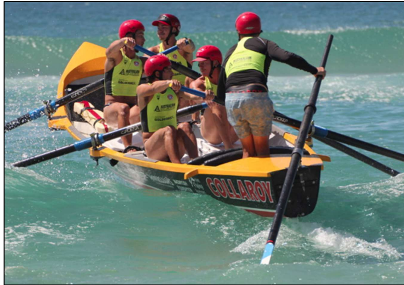
Collaroy Long Necks – Finalists U23 Male Surfboat