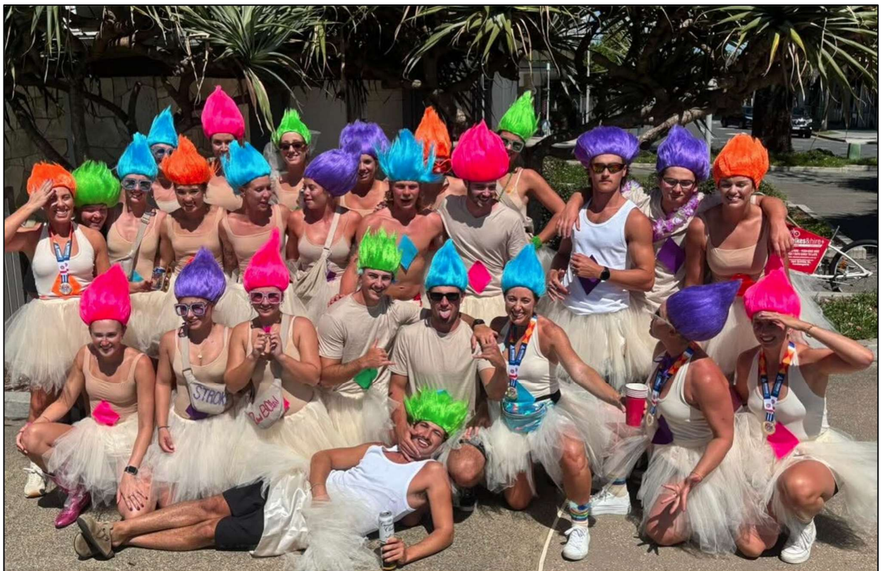
Mad Monday celebrations at Kirra Beach Hotel