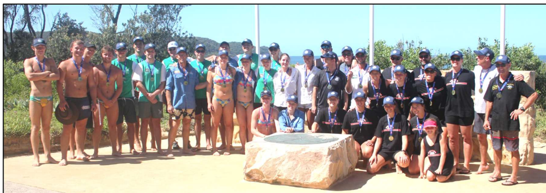
Presentation at Ocean Beach following the event

Sydney Northern Beaches Rays were successful in winning the State Title.