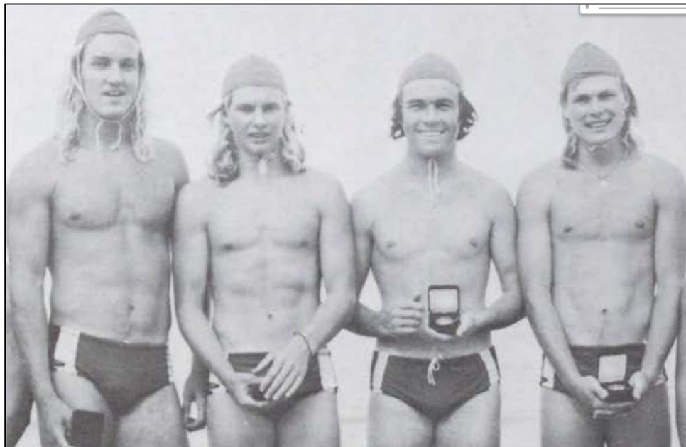
1975 Junior Beach Relay