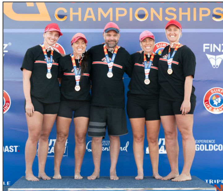
Collaroy Giants on the dais – first Open Surfboat Aussie medal since 1946

CONGRATULATIONS TO THE COLLARROY GIANTS AUSSIE GOLD IN THE OPEN FEMALE SURFBOAT FINAL!!