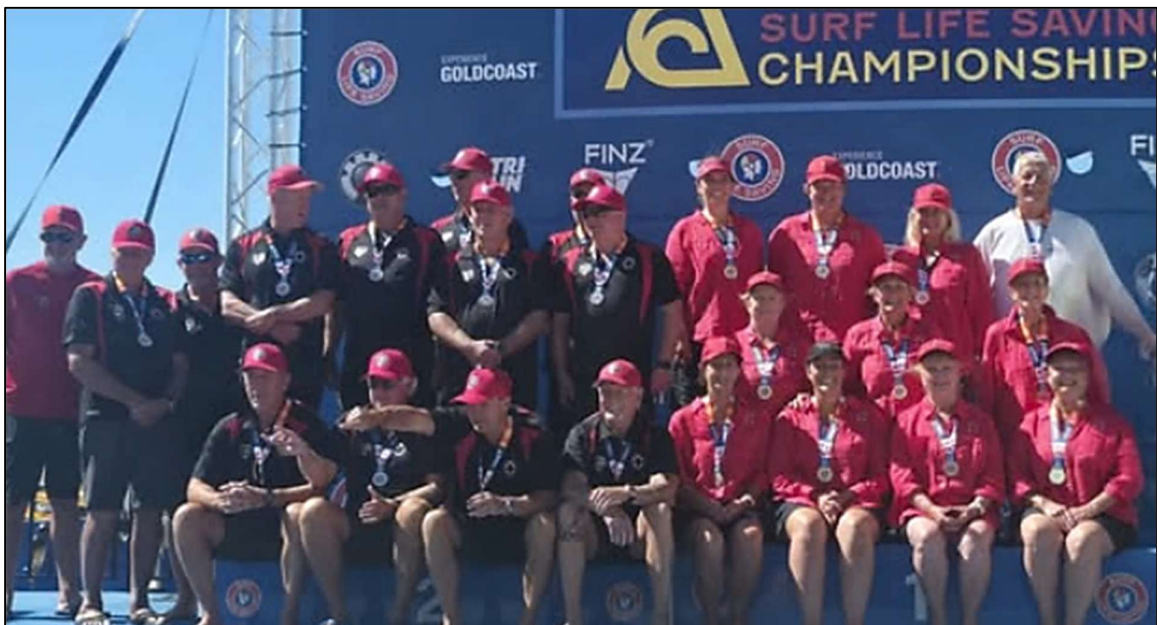
Collaroy Bears and Collaroy Ladies – Open March Past Presentation