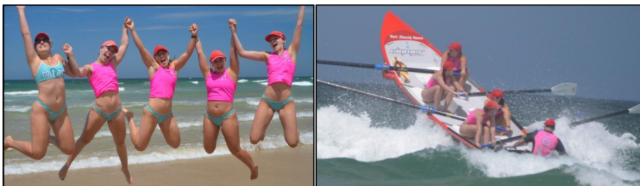
Collaroy Cobsaders competing at Wauchope Bonny Hills

Collaroy Cobsaders (Combined Cobras and Crusaders) competed in the Open Female Boat division at Wauchope Bonny Hills in the North Coast Boat Series on 15 and 16 November 2025.