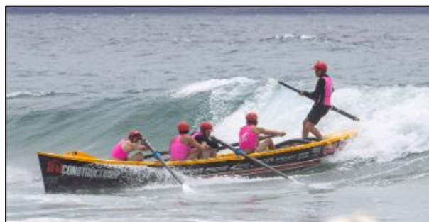
Some of the action from Palm Beach