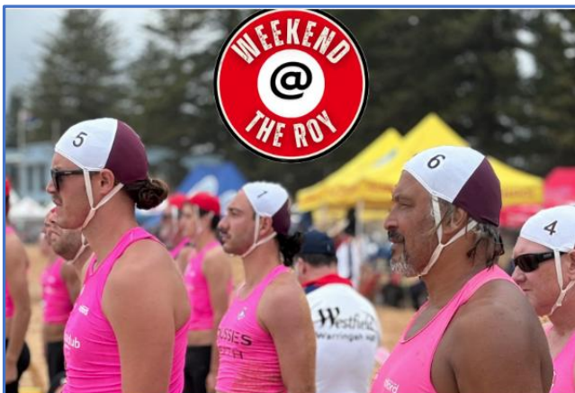
Open R&R Saturday 24th Jan