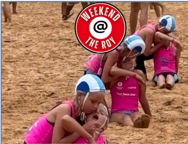
Junior R&R Saturday 24th Jan