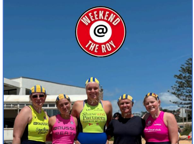
Open Surf Belt Race Saturday 24th Jan