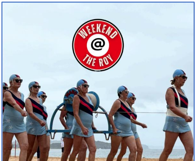
Open and Junior March Past Saturday 24th Jan