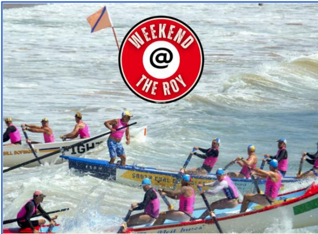
Open & Reserve Surf Boats Saturday 24th Jan