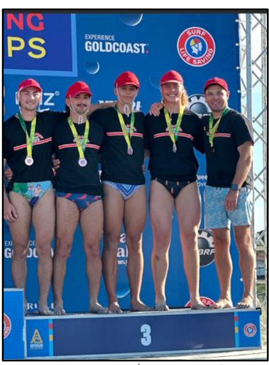
Collaroy Black -m 3<sup>rd</sup> U19 Male Surfboat

<u>U19 Female Surfboat</u> – 1<sup>st</sup> place Collaroy Cannons <u>U19 Male Surfboat</u> – 3<sup>rd</sup> place Collaroy Black