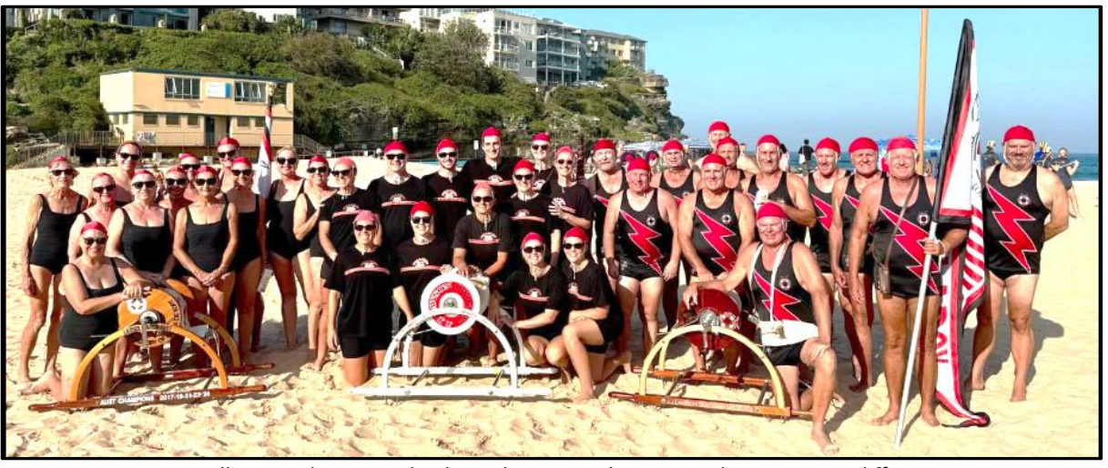
Collaroy Ladies, Comebacks and Bears at the State Titles at Queenscliff