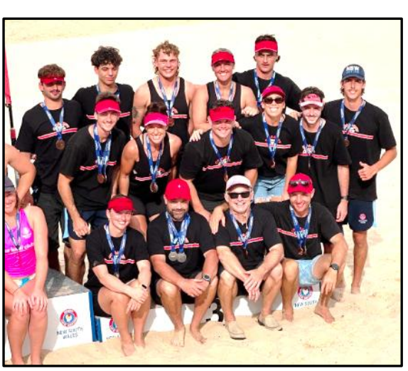
Surfboat Relay Team – 3<sup>rd</sup> place State