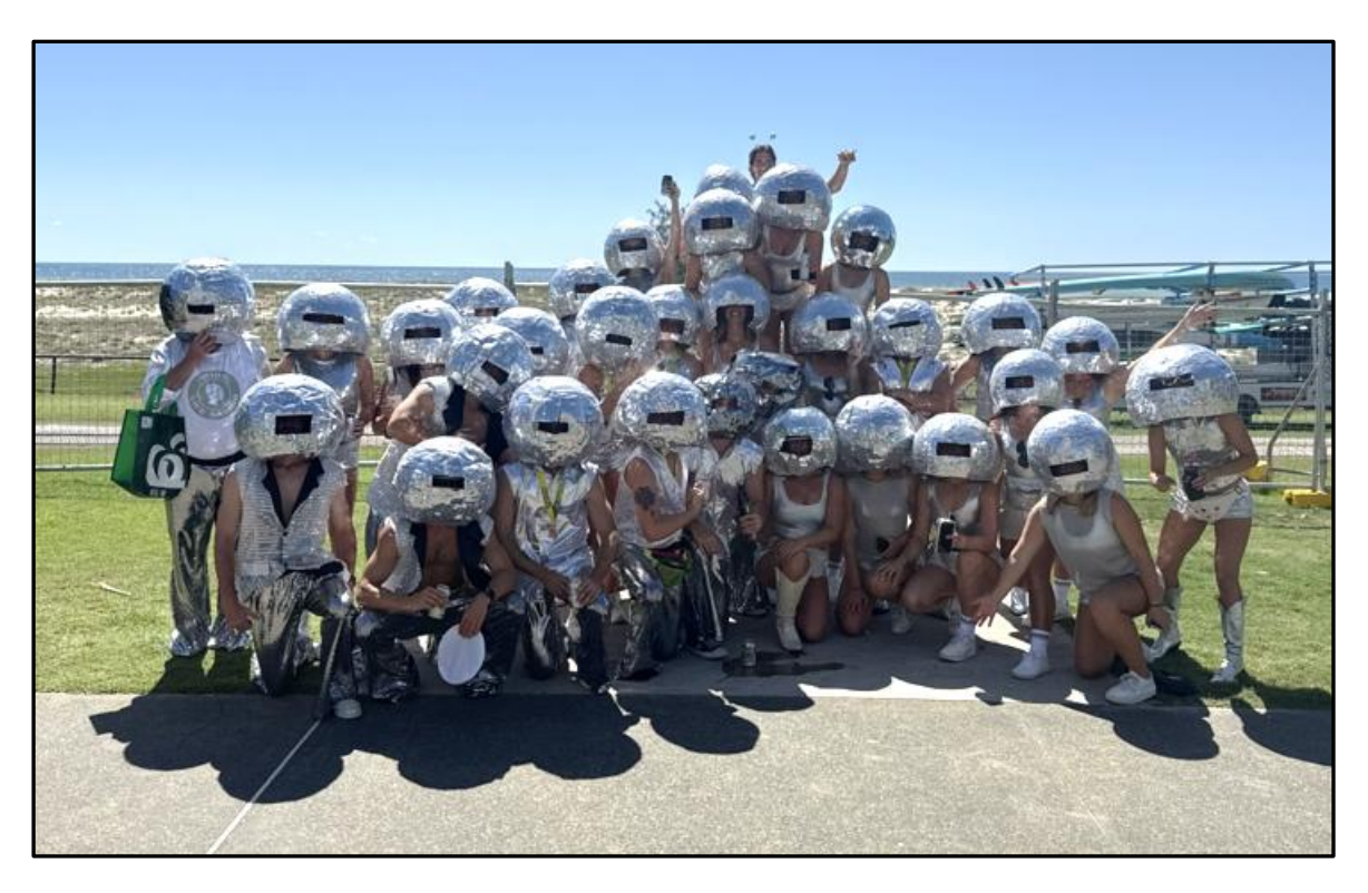
Collaroy Boaties dressed as disco balls for the Boaties Mad Monday Bash – theme "Let's Get Physical"

Minimum Bronze Members includes; o 1 x proficient ARTC o 1 x proficient IRB Crew o 1 x Beach Management o 1 x proficient IRB Driver