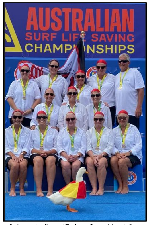
Collaroy Ladies – 1<sup>st</sup> place Open March Past