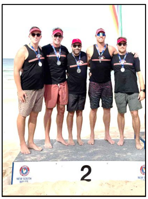
Reserve Male Surfboat – Collaroy Red