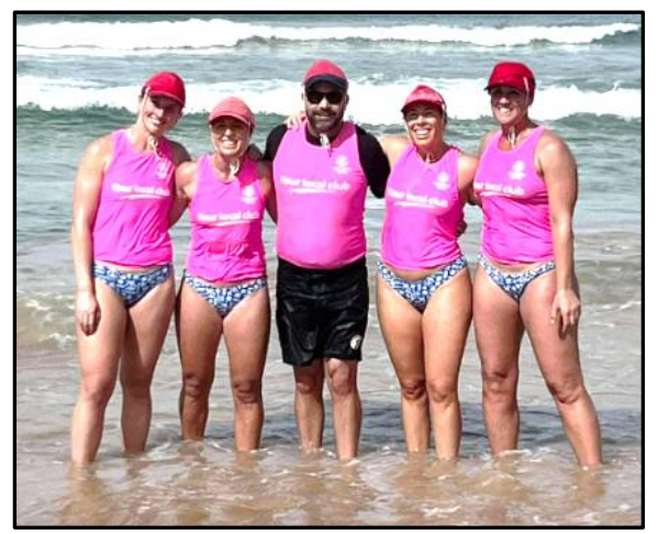
Open Female Surfboat - Collaroy Giants - 2<sup>nd</sup> at State