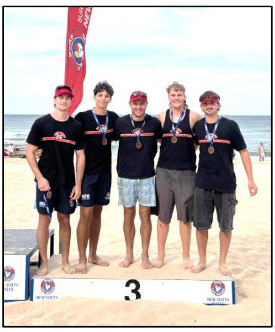
U19 Male Surfboat - Collaroy Black

<u>U19 Male Collaroy Rowdies</u> finished 10<sup>th</sup> in the South Area Round Robin – 2 places below the cut off.