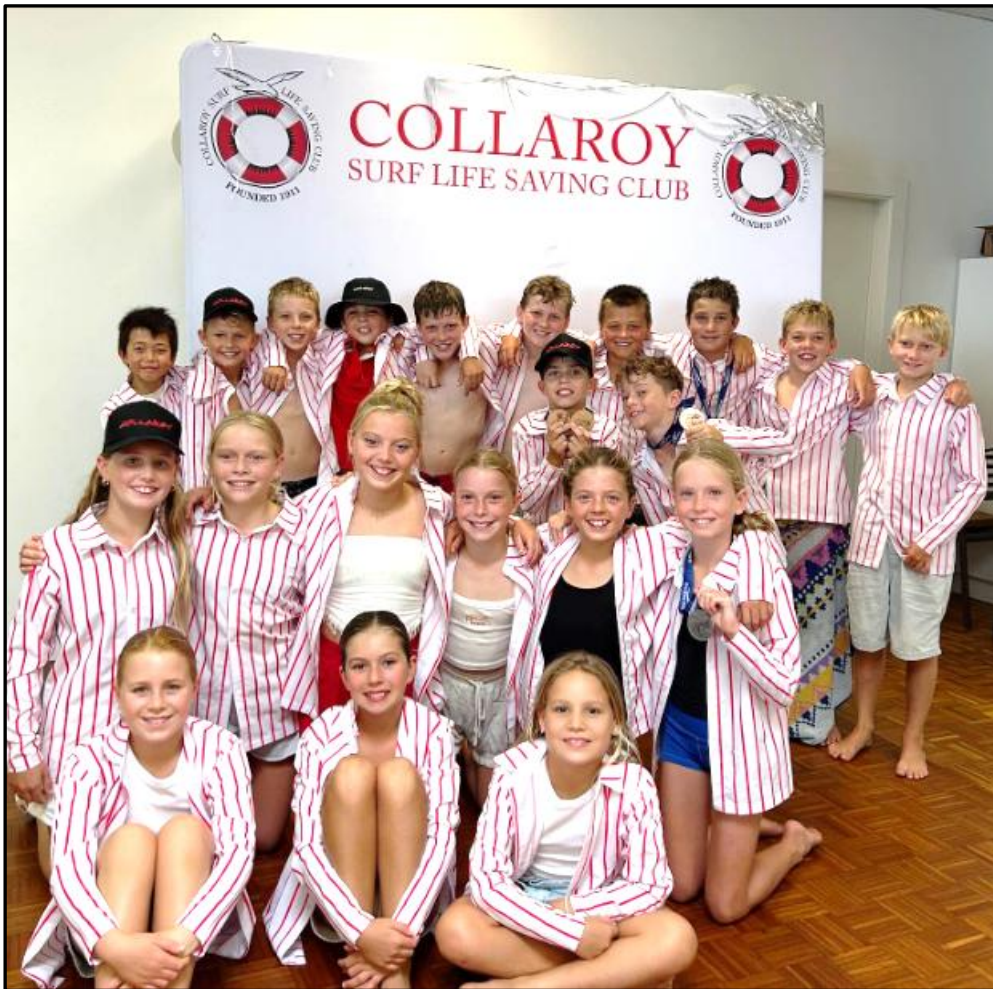
Nippers State Team