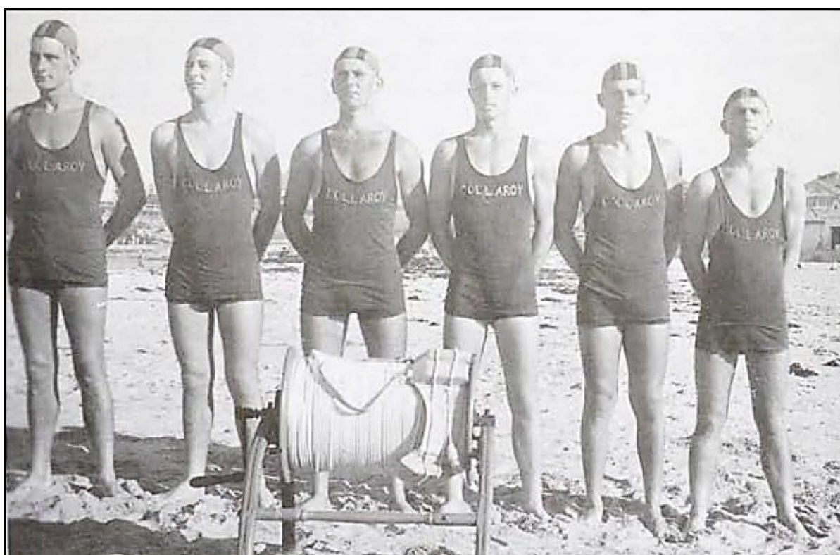
Junior R&R Team 1938/39.