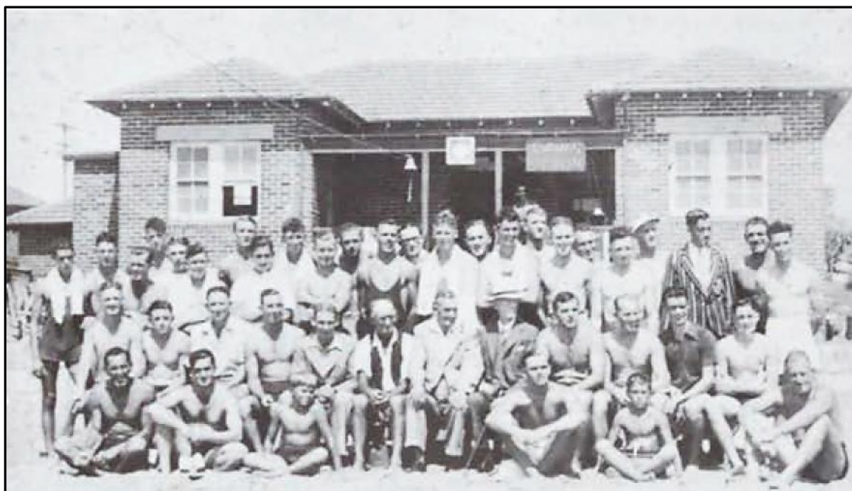
Members 1938/39 Season in front of the Clubhouse