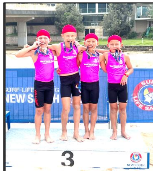
U10 Boys Beach Relay – 3 rd place at State