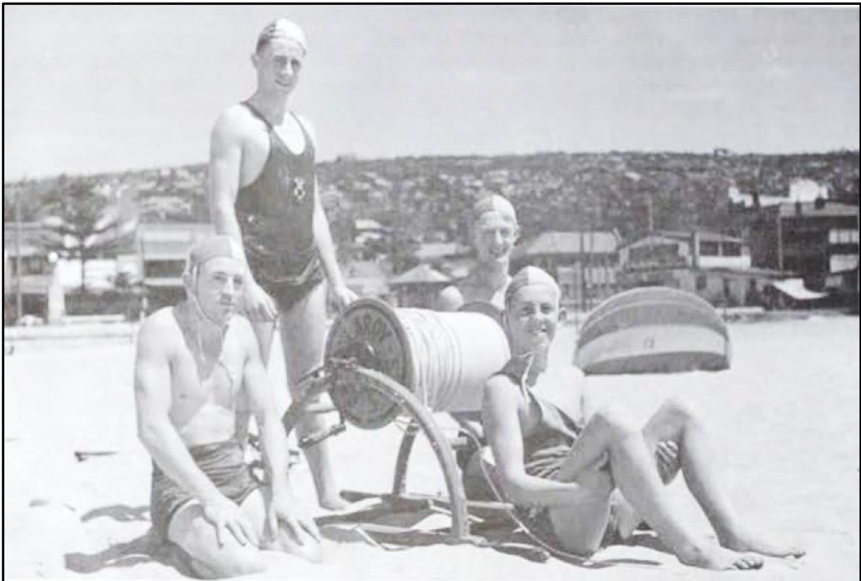
Patrol efficiency winners 1939/40 sporting the Association's new patrol caps. These red and yellow quartered caps were introduced in 1939 to identify lifesavers and became mandatory in the 1980s.