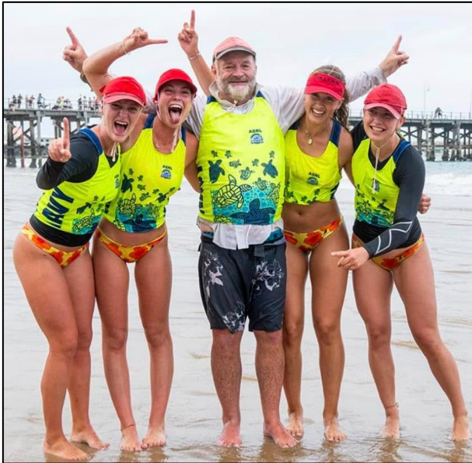
Collaroy Cannons – 1 st U19 Female Surfboat ASRL Championships

U19 Female Surfboat – 1 st place Collaroy Cannons