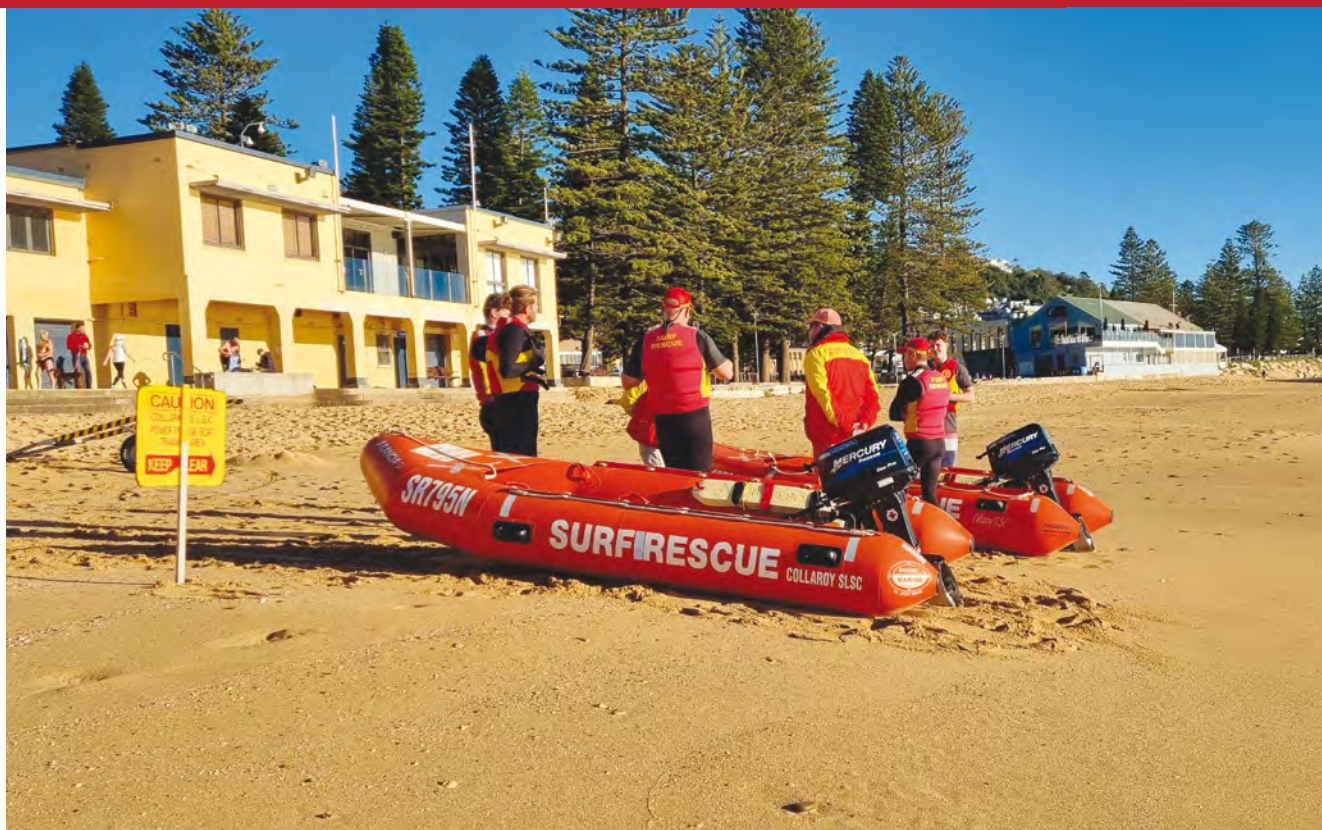
IRB Training at Collaroy