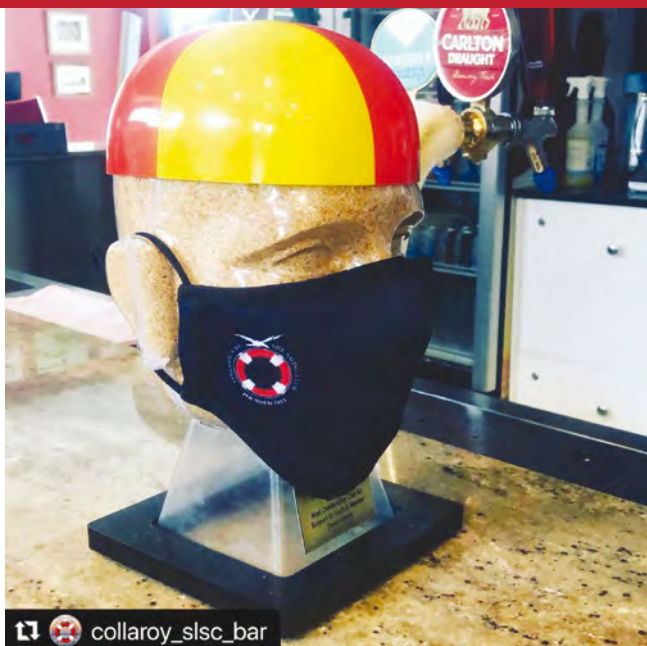
A Bar Mask