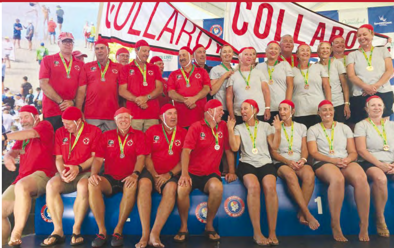
March Past Teams on Aussies Podium

There were introductory competition events including surf boat teams, surf teams, beach sprinting and of course a march past grand parade.