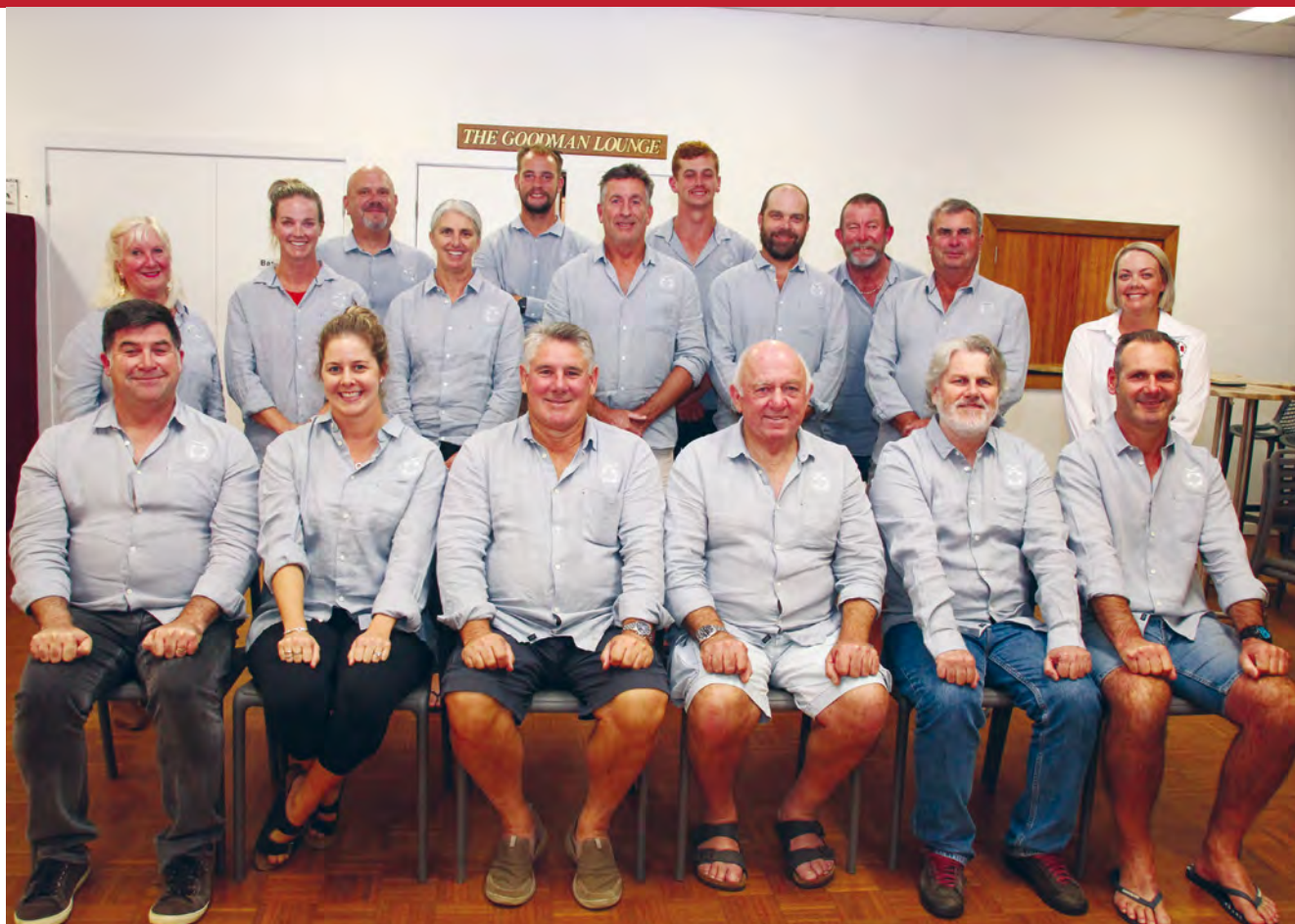
The General Committee