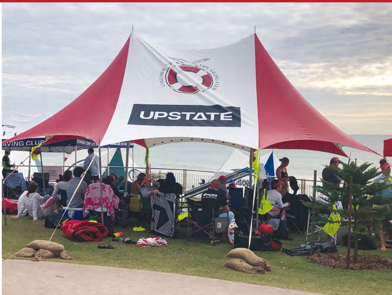
Collaroy Team tent at Aussies