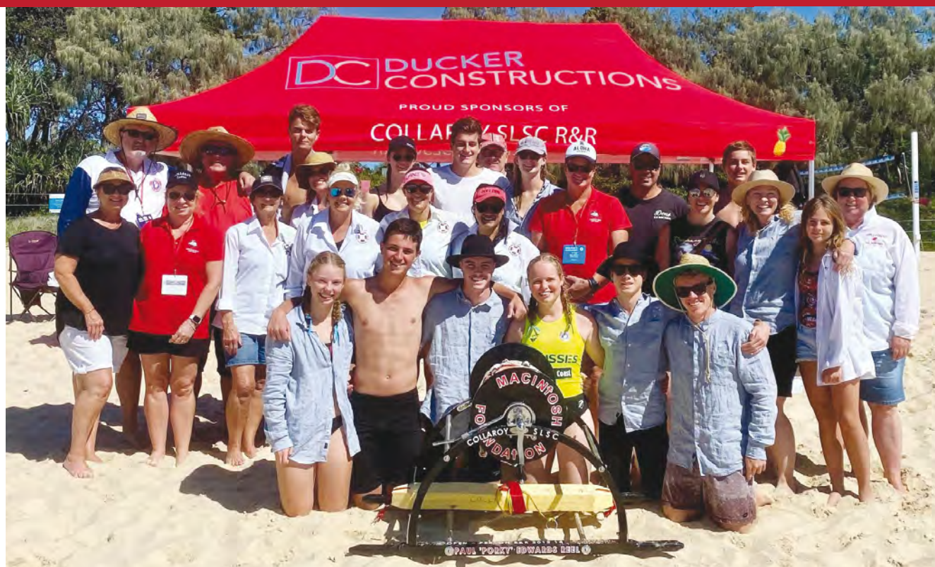
RnR Team at Aussies

competed at the Branch and Aussies Titles this season and unfortunately had to miss State due to the COVID-19 bubble restrictions. Despite some positional changes, the team kept training hard and gelled together quickly resulting in a gold medal at Branch and an excellent performance at Aussies saw them walk away with the silver medal. This was an excellent result for the girls and something they should be very proud of as medals are always tough to win in this event. One day we will get our hands on that elusive Aussie gold medal and hopefully that will be next year.