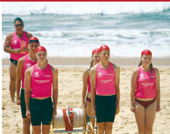
U17 5Person - winners of the 'Paul and Jacqui de Kort R&R Team of the Year' award